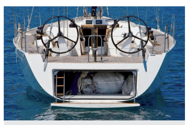
SOLARIS 48' "CRAZY TOO" (above): customer rods link the transom door to the cars on the track of Magic Door system

The Magic Door system manage the movements of the door; it is possible to stop the system in every moment without any risk. Moreover, the sheets work as a bumper to protect the system from waves hits and overloads.