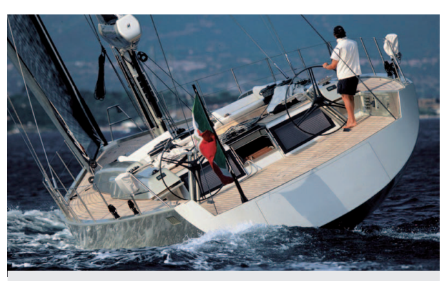
Wally 80 "Inti" (former "Indio"): Magic Door ram controls the bath platform